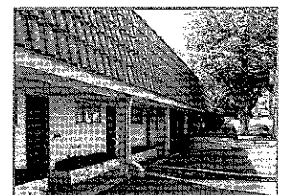
CCS North County Location

Many people think we can't make a difference when it comes to domestic violence and sexual assault. Looking back on the 35 years that CCS has just completed is proof that indeed we can. Everyday we are helping more and more people. This is a testament to our amazing staff and volunteers and represents an increase in community awareness and people reaching out for help. The more people know and the more people we educate, the better it will be for our community