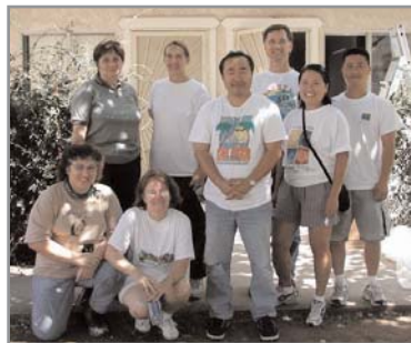
NCR Teradata Staff Members