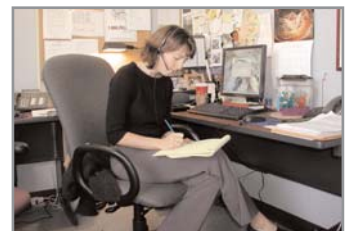
Hotline Staff Member Working on a Call.